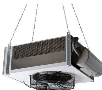
CellFlow Ind8500 SC ceiling, also available as CellFlow Ind5000 SC, as well as in Mobile versions (wheels)