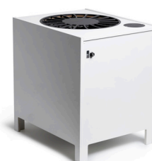
CellFlow Ind2500 Floor SC floor standing (also available as CellFlow Ind5000 Floor SC)